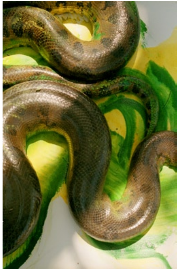
Anaconda, Venezuela, 2000