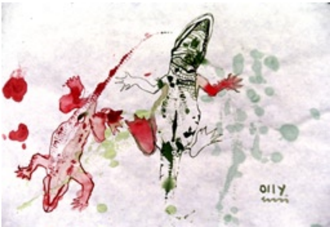
Red croc, Green croc, Northern Australia, 1999