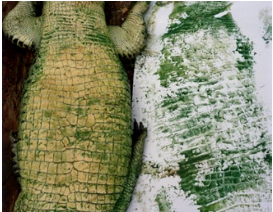
Croc body print, Australia 1999

And what are the artistic sensibilities of a Great White Shark? Art duo Olly & Suzi's unique animal 'collaborations' show we are all wild at art